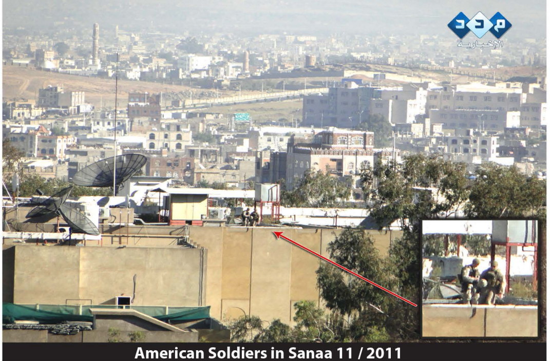
American Soldiers in Sanaa 11 / 2011